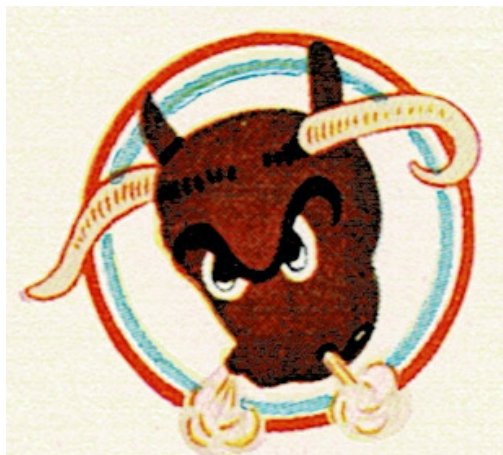
13 Fighter Squadron (Single-Engine)